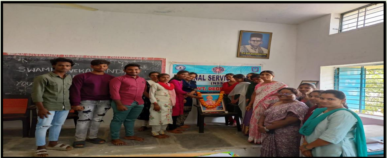
Teaching and Non Teaching Staff of the College along with students

The theme of this year is “Viksit Bharat @2047 yuva ke liye yuva ke dwara”